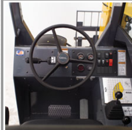
A modern, ergonomic design maximizes comfort and productivity