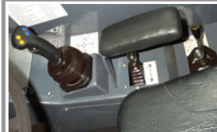
Tri-function control option allows an operator to control attachment tilt, auxiliary hydraulics, and boom function